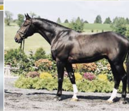
1991 KWPN Crown Stallion Dark Bay, 17H by Consul out of Faletta Star, Pref