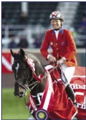
Willfull by Judgement ISF