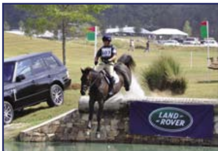
Zenith ISF by Judgement ISF